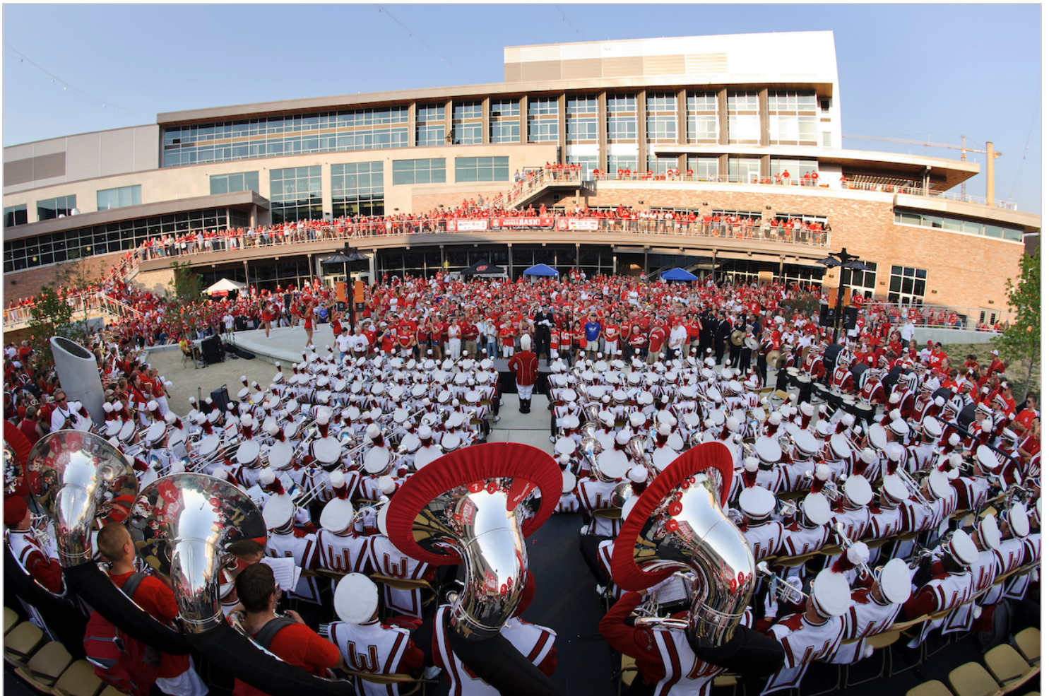
The UW marching band performs for Badger fans by Union South during the Badger Bash on Sept. 1, 2011.